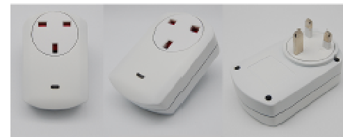
UK type PAN11-3B