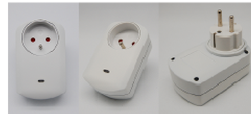
France type PAN11-2B