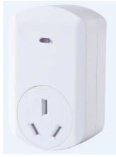
China type PAN11-8B

Note: Please make sure that the intensity of the plug of the electrical device must be 16A and have same head as the enclosed plug before inserting to the socket.