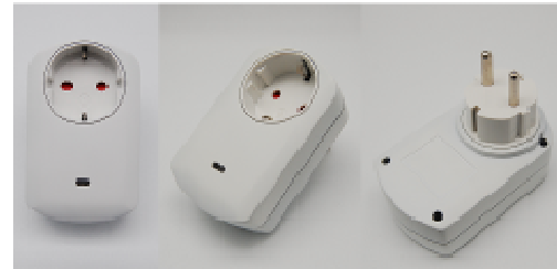
Germany type PAN11-1B

Since the socket type for each country in Europe varies, refer to the outline for each socket suited for each country as follows: